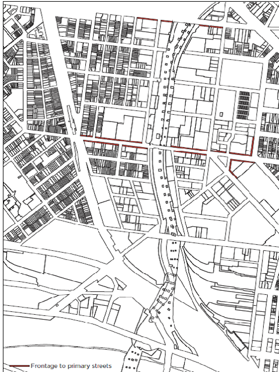
Map 2 – Frontages to primary streets