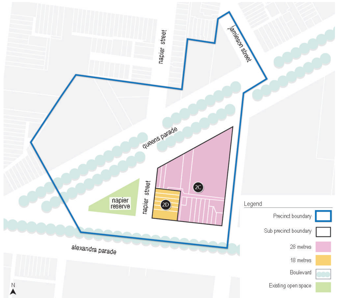
Map of Precinct 2