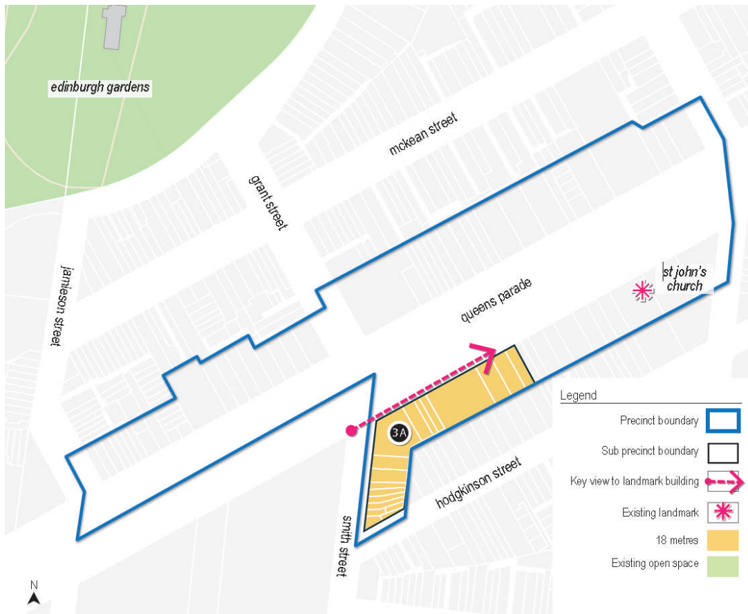
Map of Precinct 3