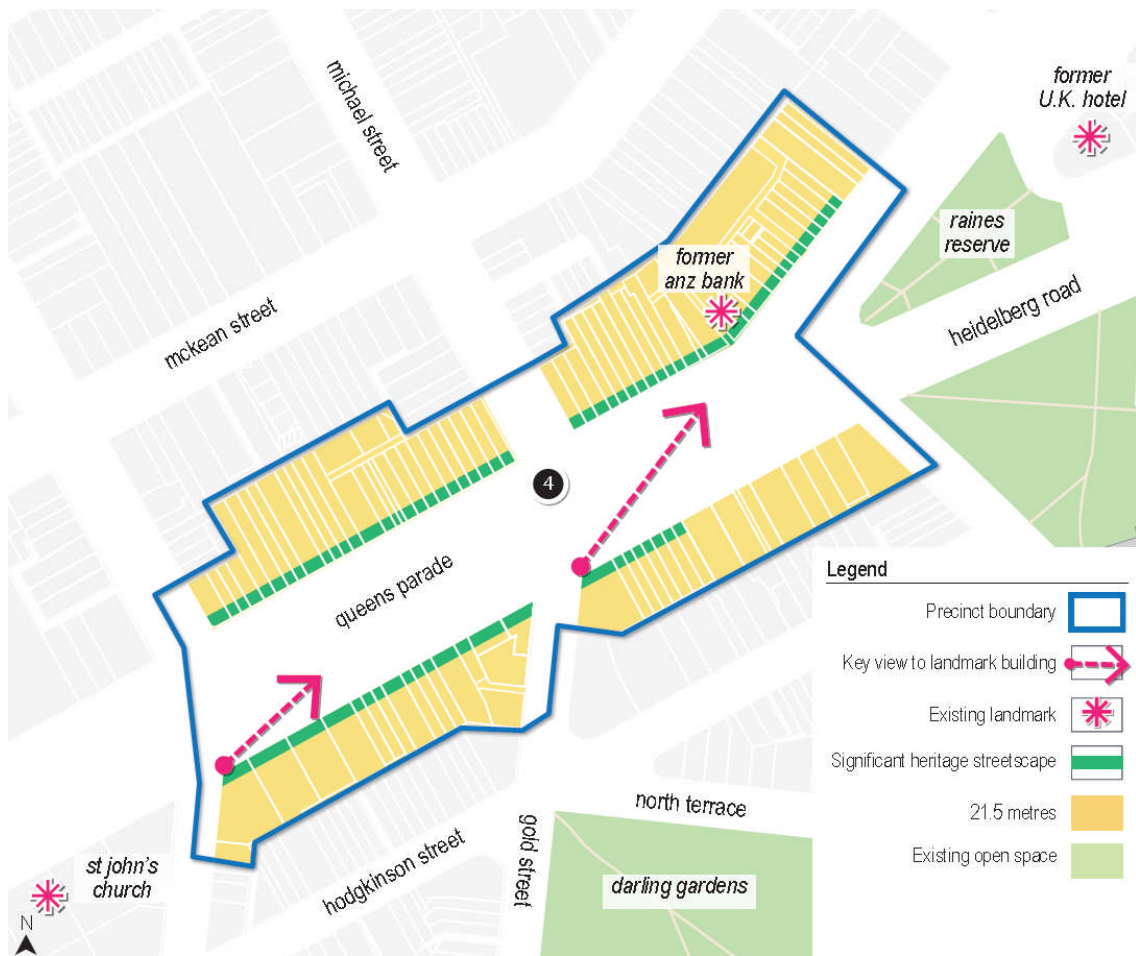
Map of Precinct 4