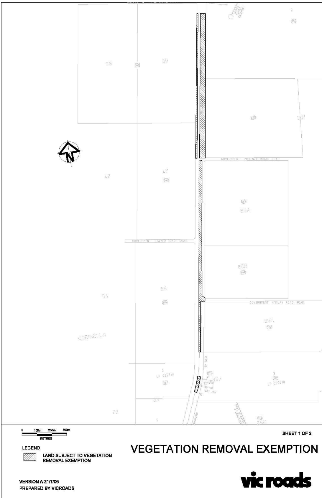
Map 2 to the Schedule of Clause 52.17