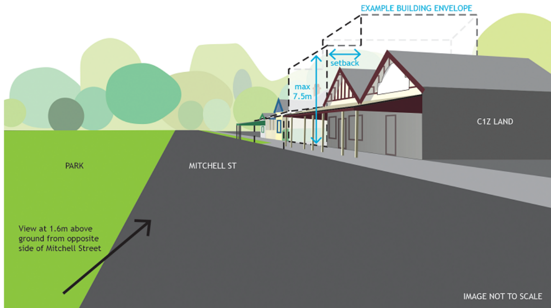
Figure 2 Illustration of Building Façade Controls